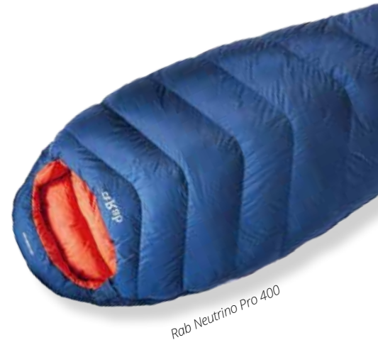
Rab Neutrino Pro 400